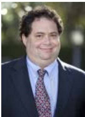
Blake Farenthold Republican http://www.blake.com

Put Cafta and nafta on a level playing field, end strict regulations that stifle industry, national Tort Reform and end Capital Gains Tax for 2 years. Close loopholes that allow foreign capital investments without collecting taxes. Lower taxes and entice investments. Reinvest in American markets, end unfair foreign competition that strangles American companies. US government to buy American first.